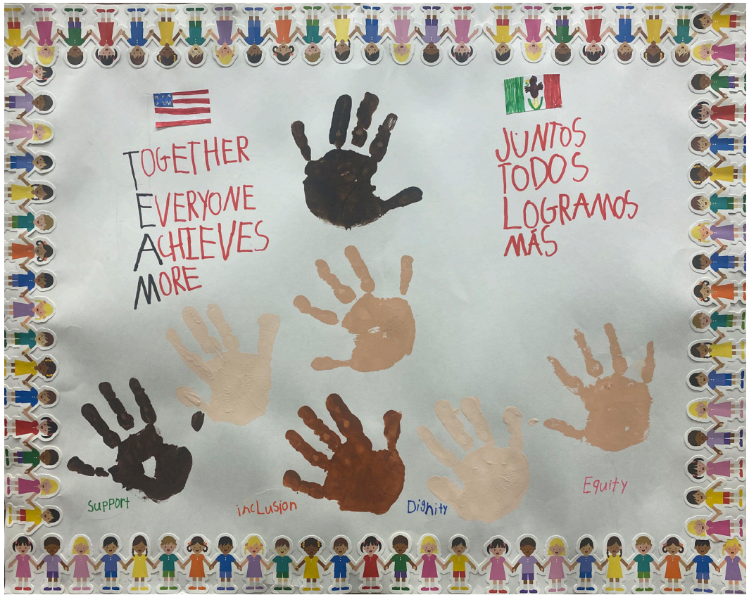
Aiden - Rockbrook Elementary - Grade 1