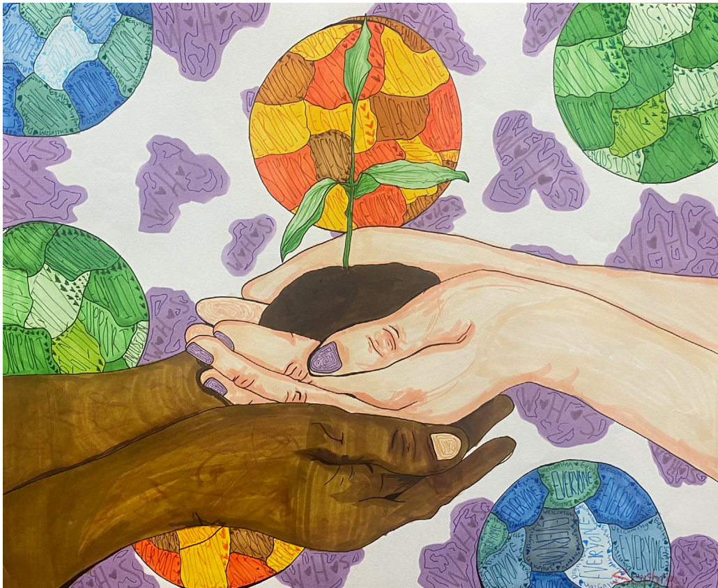
Sophia - Westside High School - Grade 9